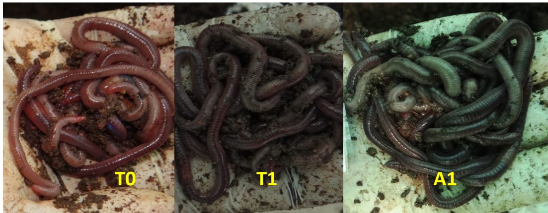
Fig. 1 – Matured earthworms of control and treated with seaweed gel and seaweed fortified granules.

Different letters indicate significant difference at the 0.05 level